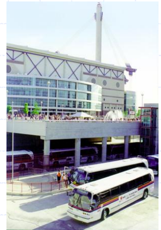
Alamodome Transit Entrance. VIA Metropolitan Transit; San Antonio, TX