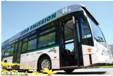
Van Hool Fuel Cell Bus. AC Transit; Oakland, CA