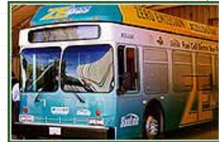
New Flyer Fuel Cell Bus. Sunline Transit; Thousand Palms, CA