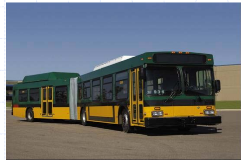
New Flyer Hybrid Bus. Intended for Seattle, WA