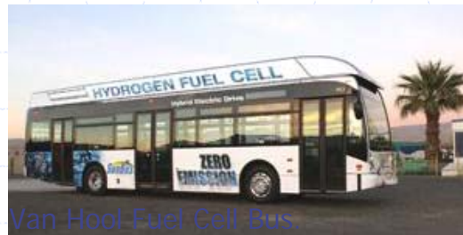
Van Hool Fuel Cell Bus Sunline Transit; Thousand Palms, CA