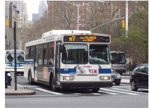
Orion Hybrid Bus. MTA; New York City, NY